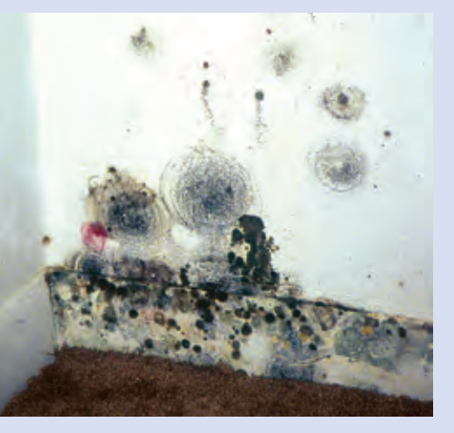
Photo 3A: Mold growing in closet as a result of condensation from room air