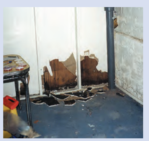
Photo 3B: Front side of wallboard looks fine, but the back side is covered with mold