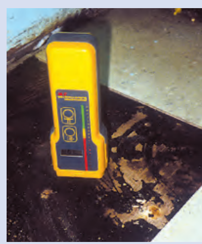
Photo 9: Moisture meter measuring moisture content of plywood subfloor